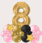
Letter / Number Display