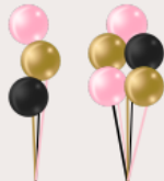
Helium Filled Latex Balloon